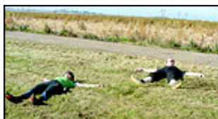
Traditional English tea break

• The London - Paris Bike Challenge was exactly that (definitely went from London to Paris and we were undoubtedly challenged!) but was an enormous success.