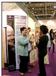
Y2L at CAMExpo

• CAMExpo: Last year's exhibition proved an excellent way of raising awareness of Yes to Life amongst CAM (Complementary & Alternative Medicine) practitioners, so we gladly accepted the organiser's offer of another free stand. Apart from meeting practitioners face to face, we also had the opportunity to meet many other key people within the sector and to attend some excellent lectures.