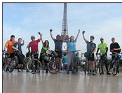
Blackpool at last!

With Y2L flags flapping gaily in the Paris sunshine, French jaws dropped as our team of plucky Brits, effortlessly bantering to one another in Franglais,