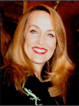
Jerry Hall

• Recent months have seen significant new celebrity support for our work. We are absolutely thrilled that actress and supermodel Jerry Hall , who attended our Gala Dinner in January, has now become one of our key supporters.